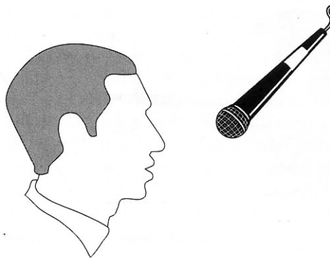
Best Microphone Position